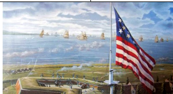
Broad Stripes and Bright Stars